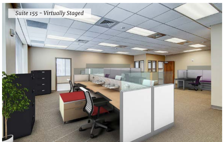
Suite 155 - Virtually Staged